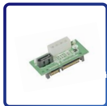
SATA DOM Adapter*

*There are 3 types of power supply for SATA DOM cards. Please double check before purchase.