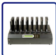
Duplicator x 1