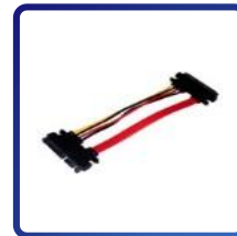
SATA 22PIN Extension Cable