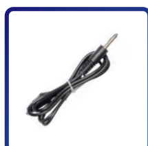
Grounding Cable x 1