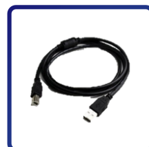
USB Cable for PC Link x 1