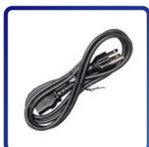
Power Cord x 1