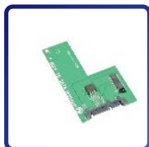
M.2 (NGFF) Adapter