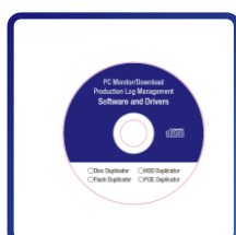
PC Link Software Disc x 1